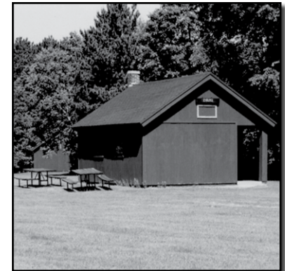
There are four cabins, Rotary, Elks, Horgen and Evans, at Phillips Scout Camp. Two of the cabins are handicapped accessible.

Samoset Boy Scout Council Wausau Homes Scout Center 3511 Camp Phillips Road Weston, WI 54476