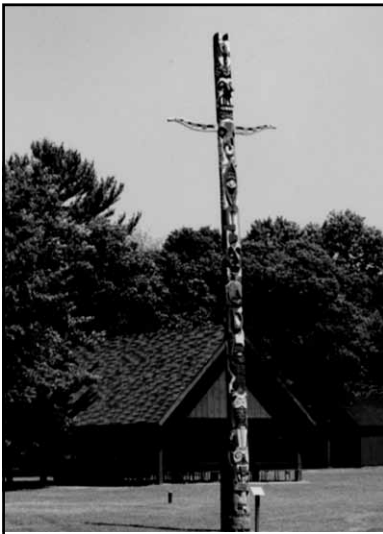
A program shelter is available with lighting, 10 picnic tables, and a cooking grill (charcoal only)

McCormick Lodge is a modern day dining hall which has a fully equipped kitchen including cooking supplies, cleaning supplies, silverware, electric range, refrigerator, and microwave. The lodge is heated with a gas furnace, has a restroom, running water, and is handicapped accessible. The dining area is equipped with tables and chairs. There is no sleeping in the lodge, and mattresses are not allowed to be brought into the lodge from any of the cabins.