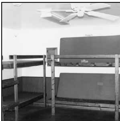
Each cabin offers 10 bunks, a table and benches, lighting, gas heat and ceiling fans.