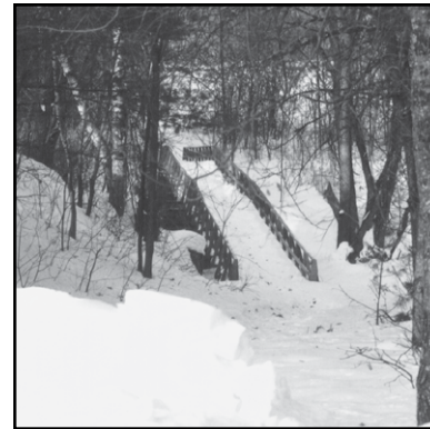
The bridge to the island is ideal for crossover and bridging ceremonies.

Phillips Scout Camp is dedicated to our youth for the primary purpose of Scout camping. It is available to all youth or civic organizations dedicated to or promoting youth activities, subject to the rules and regulations of the facility. The camp is available for short-term camping and training. Non-Scouting units are welcome, but are required to have a certificate of insurance and a hold harmless agreement on file with the Council office.