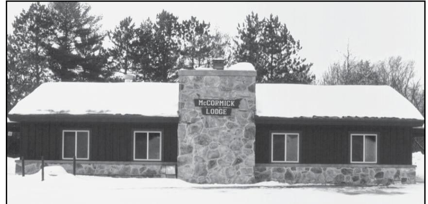
McCormick Lodge features a full kitchen, restrooms, and dining hall.

Phillips Scout Camp is dedicated to our youth for the primary purpose of Scout camping. It is available to all youth or civic organizations dedicated to or promoting youth activities, subject to the rules and regulations of the facility. The camp is available for short-term camping and training. Non-Scouting units are welcome, but are required to have a certificate of insurance and a hold harmless agreement on file with the Council office.