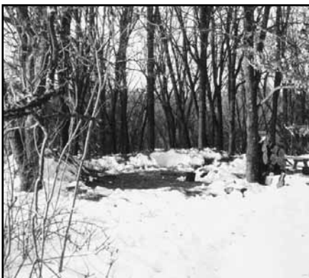
Campsites are available for primitive camping.

Phillips Scout Camp offers a sports field, horseshoe pits, nature hiking, and two main campfire areas. In addition to the cabins, campsites are available, including an island site that is perfect for primitive camping. There is a flagpole and fire pits on the island.